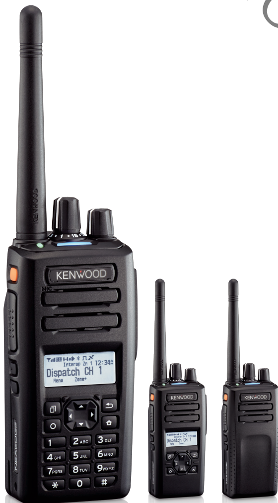
Full Keypad Model